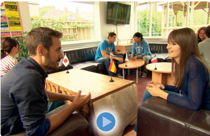
Conversation- Library- Student

2- What do you think the video is going to be about?