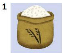
There's a lot of rice / sugar.