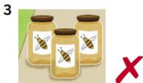
There isn't any honey / flour.