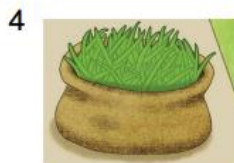
There are a lot of grapes / beans.