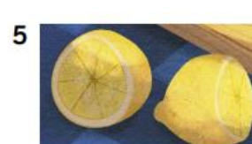
There aren't many / any lemons.