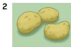
There are a lot of / some potatoes.