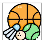
PE (physical education)