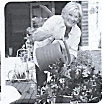
6 h _____ a g _____

b Match the verbs and nouns to make verb phrases.