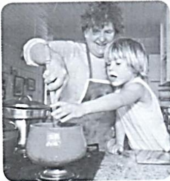
1 cook _____ dinner _____