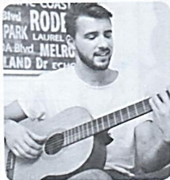
2 pl _____ the g _____