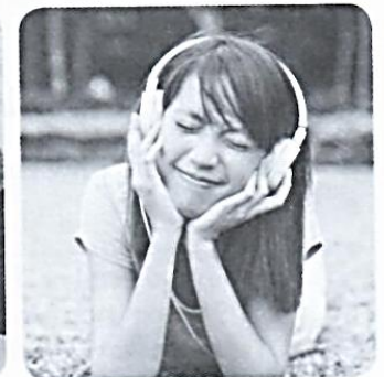
4 l _____ to m _____