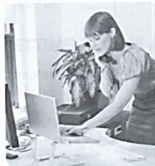
3 w _____ in an o _____